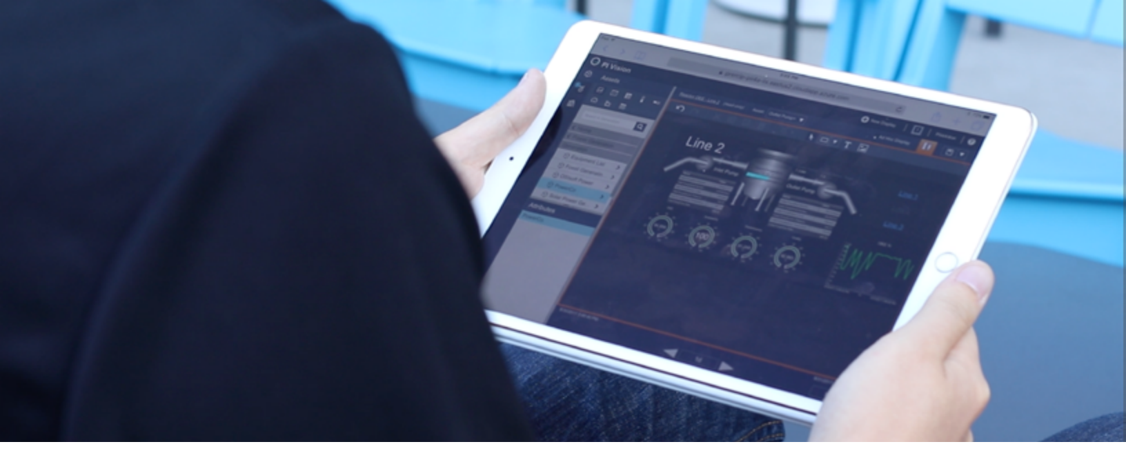
Real-time Review: A single steam turbine is easy to manage with all the data, tickets, and image widgets working in tandem on one easy-to-analyze PI Vision page.